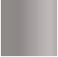
Brushed Aluminum - BAL